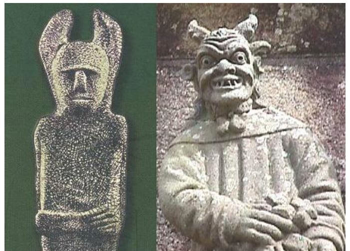
Celtic god and Breton devil

Deep inside our skull, we don't consider Paolig, our horned devil, as a frightening monster from a far away world. He is a kind of neighboring outsider, coming from our own ancient world of death and chaos. The old Celtic warriors, our ancestors, with horns on their helmets, probably had this strong feeling of being outsiders, bringing death and chaos with them. Today, contemplating the crescent moon, we try to imagine the mysterious creature behind these golden horns.